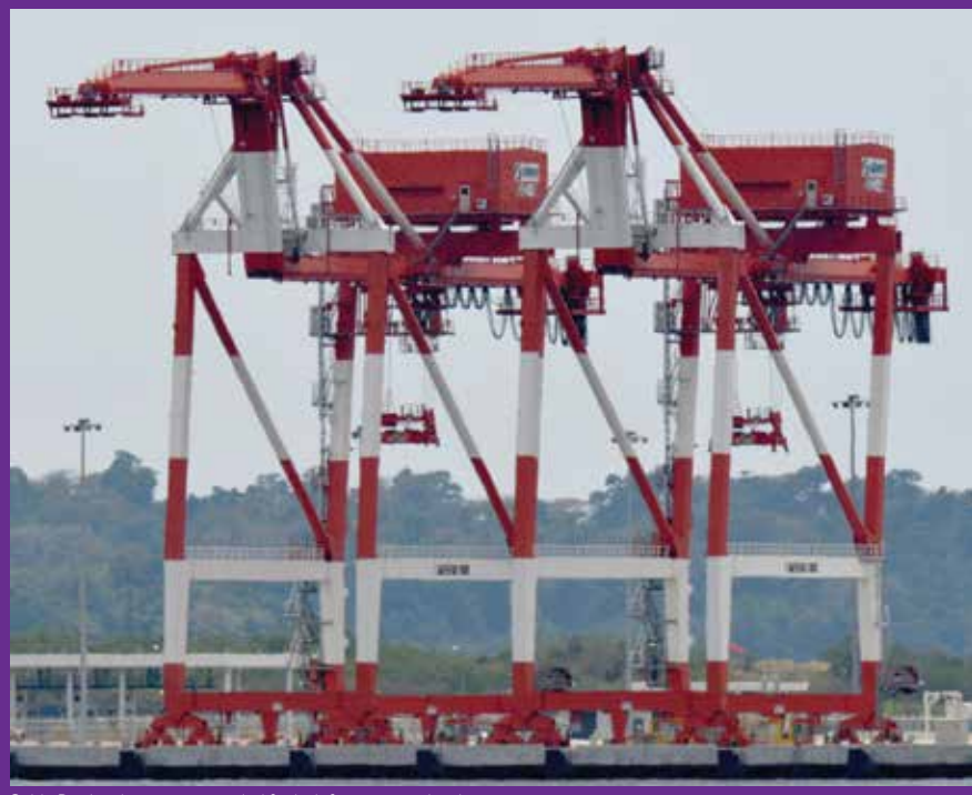
Subic Bay has been commended for its infrastructure developments