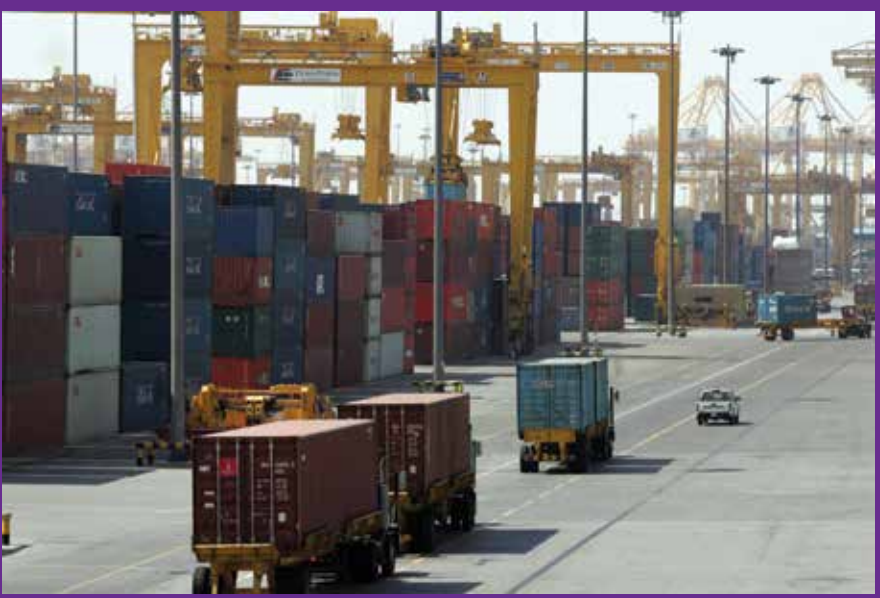
lebel Ali Free Zone has finished runner-up for the Middle East region in this year's awards

soared past 40,000 in 2014, a 10% increase on 2013's figures. Reinvestment projects also increased from 17 reinvestment projects in 2013 to 33 in 2014, including reinvestments from major companies such as 3M, Colgate, Electrolux and Bosch. The zone offers a wide range of services for investors, including the construction of production floors for SMEs, coordination with local authorities and assistance in dealing with administration and utilities providers. Walbrzych Special Economic Zone was also recognised for its infrastructure developments and facilities upgrades, thanks in part to the construction of two new industrial storage facilities, and plans to construct two more (much larger) facilities.