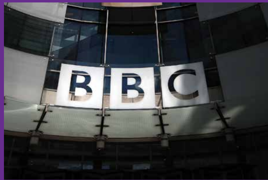
BBC: one of TwoFour54's major media clients, along with Bloomberg and CNN

Favourable conditions are provided in the zone for tourist and recreational activity, with preferential tax rates, financial support for the provision of infrastructure and a 'one stop shop', providing streamlined support for administration.