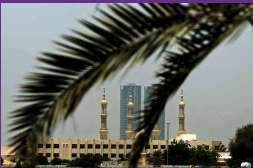
A view of Ras Al Khaimah. The emirate's free trade zone is expanding with a 55% increase in employee numbers in 2014

Sohar Port and Freezone, which is approximately 200 kilometres from Oman's capital of Muscat, has been commended for ease of access to the zone, following a wide range of developments to the infrastructure in the zone. Gates to the facilities were upgraded, adding automated entry controls and a new Gate Pass app, which allows companies and visitors to increase the speed of access. Roads and roundabouts were also upgraded, and highways designed to